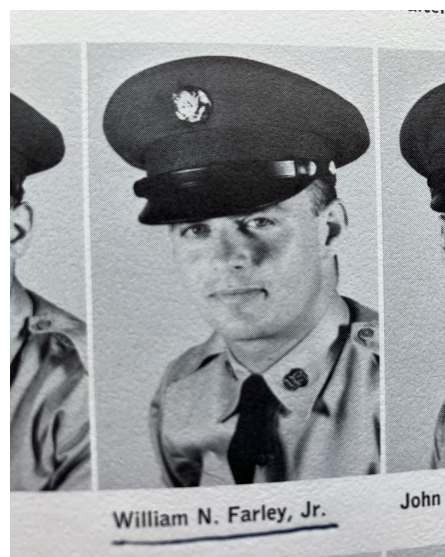
US Army 1964 to 1966